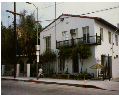
Exposition Club House Before

IBWALA will make use of the center's Senior Complex, including the patio and the adjacent garden and amphitheatre. We will also host a portion of the conference and workshops in the Olympic Swim Stadium building including the Community Hall and several multi-purpose rooms.