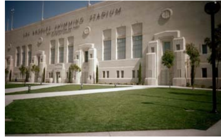
L.A. Swimming Stadium before and after August '02 renovations