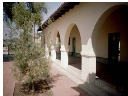
Exposition Club House/Ahmanson Senior Center After